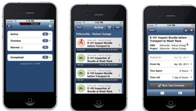
Figure 1. The P6 Team Member application enables users to easily make updates to their assigned tasks and send emails to update the project manager or other team members on the current status of the project from their iPhone.